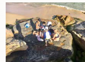
Cooking and sharing

11th - 14th & 24th - 28th January: 2:00pm - 4:30pm: La Perouse