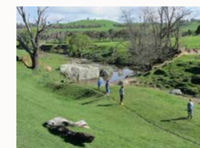
Creek side challenges