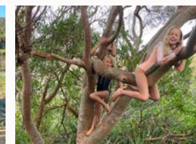
Climbing and listening to stories