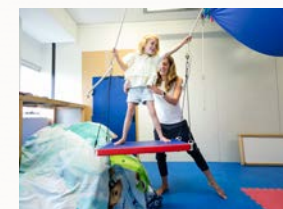
Moving and integrating with timing

Children seek to learn, grow and connect. If this is not so then may we be detectives into why and support shifting barriers and building foundations so that each child can feel empowered, capable and attach meaning to functional engaging skills for life. This intensive therapy integrates connection, exploration and joyful function into learning and doing. Daily 1 hour therapy (1 - 2 times per day) *Price varies depending on number of sessions