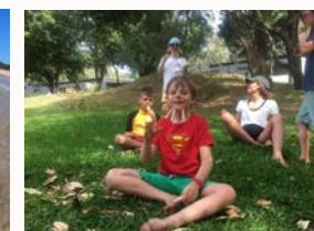
Sensory exploration and story telling