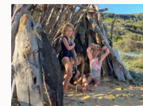
Building and exploring sensation

10th - 13th January: 9am - 1pm: La Perouse