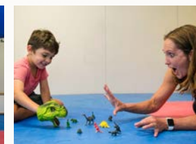
Generating and communicating ideas