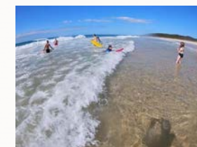
Ocean and surf therapy experiences

12th - 16th December: Departing Bondi Junction & Newcastle