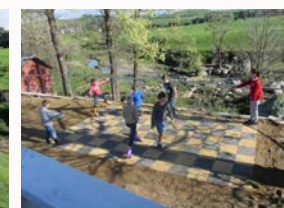
Problem solving and sharing joy