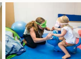
Expressing and letting go