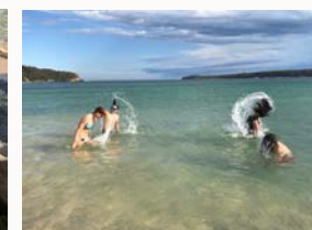
Swimming and engaging in challenges